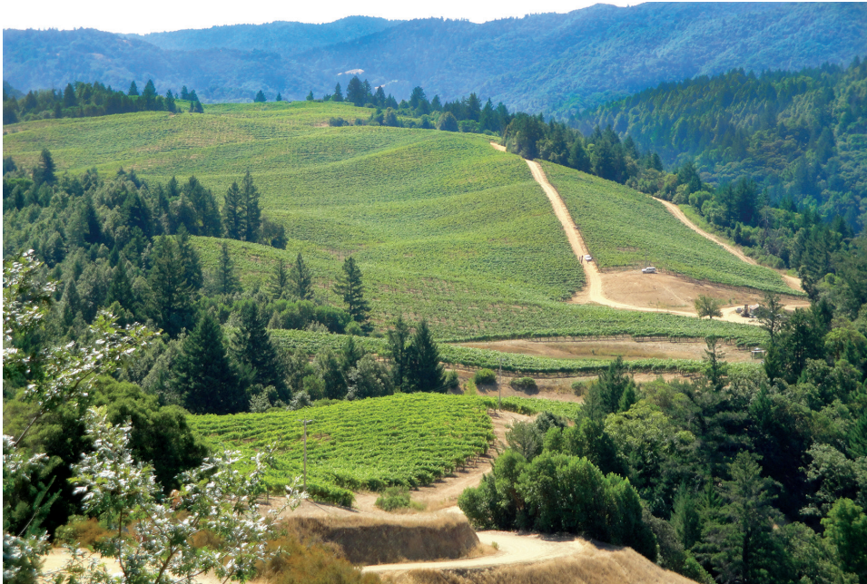
Featuring the Dorothy (foreground) and Sydney (background) Vineyards, Estate, Dry Creek Valley