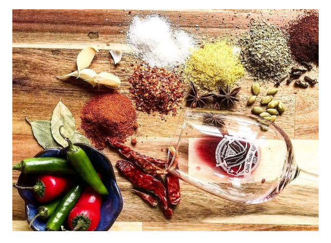
We Rocked the 4th Annual Chili Cook-Off!

With roots reaching back 140 years, Dry Creek Valley's history in wine grape growing is among the longest in California. The appellation was recognized in 1983, so 37 years ago, and in 1989, the first Passport was held! Join us in the celebration! Running April 25 & 26, 2020, sign up to start at Wilson Winery here. "Whoa, did somebody step on a duck?"